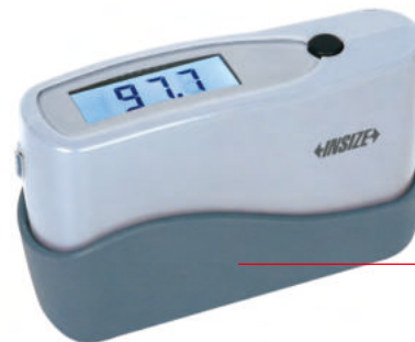
base with calibration block (included)